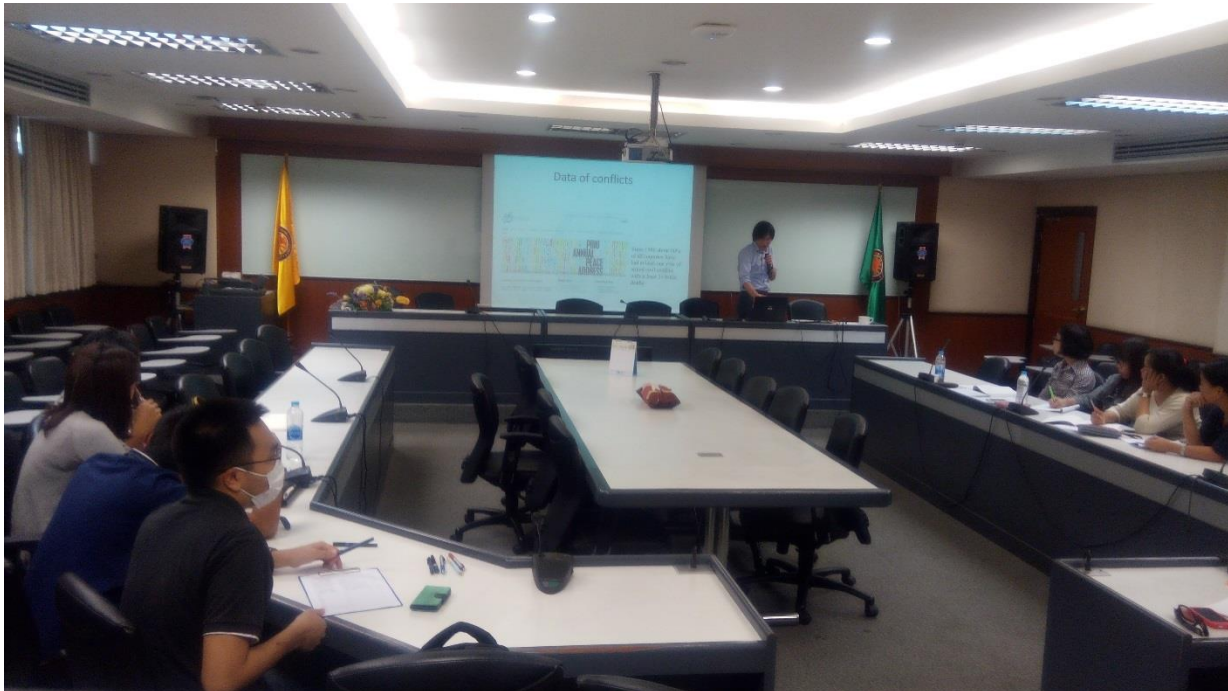
(Teaching Development Economics: selected topics I)