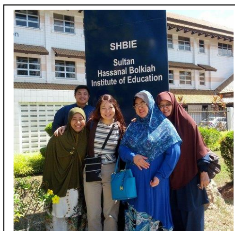
Colleagues at the UBD Institute of Education