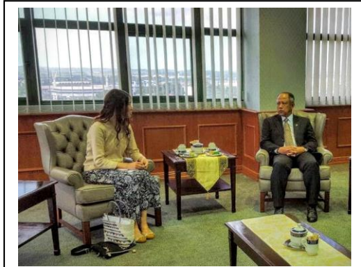
Visiting the Bruneian Minister of Youth, Culture and Sports

Overview: Brunei is a small country and there is not much awareness about its uniqueness and the strength. It has a long history of interaction with Japan and people in general have favourable views toward Japanese people and culture, therefore the interests to learn about Japanese culture and language. Although some economic downturn in Brunei is seen due to the plummeting oil price, the country is protected by its natural resource and good public investment by the government. There is a keen interest at the policy level to strengthen its economy through human resources, to open up its society towards international influence and modernization while maintaining the Islamic and traditional values, and to be more active players in ASEAN and beyond in economy, politics, education and cultural exchange. The government is recognizing the benefit of education and youth exchange with Japan, as it has the resource of unique ideas and skills. As Brunei is currently moving toward strengthening