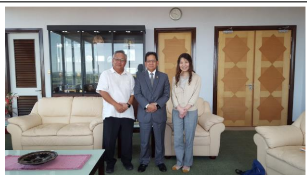
Visiting the Minister of Education and the former Bruneian Ambassador to Japan

Student exchange – UBD provides a culturally diverse and academically rich environment. I had a strong impression that they value Islamic culture and increasingly they are fostering the value at the government and institutional levels. AIU can foster exchange students with such a society by making