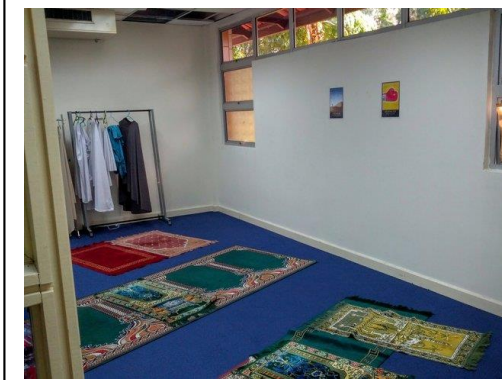
A prayer room at UBD

Faculty exchange – Faculty at AIU could benefit from the partnership more by exchanging teaching and research activities. There was an interest from the UBD faculty to visit AIU to conduct an intensive course or research, for example. We could also explore the avenue for further sharing of academic resources. Keeping the communication with the Bruneian Ministries as well as the Japanese embassy would help identify areas of interests for mutual exchange.