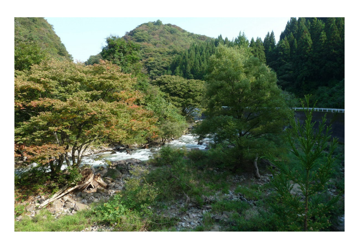
The 3<sup>rd</sup> Contest (2014)