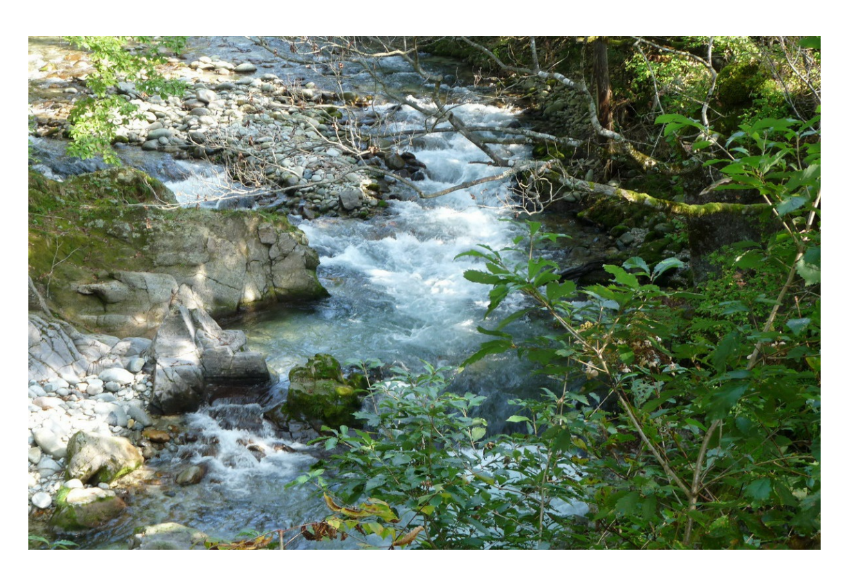
日航財団賞 (JAL Foundation Award)