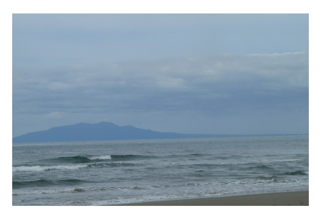
秋田県知事賞 (Akita Prefectural Governor's Award)