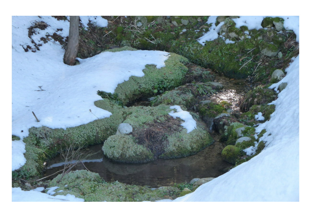
日露俳句コンテスト入賞作品 The 1<sup>st</sup> Contest (2012)