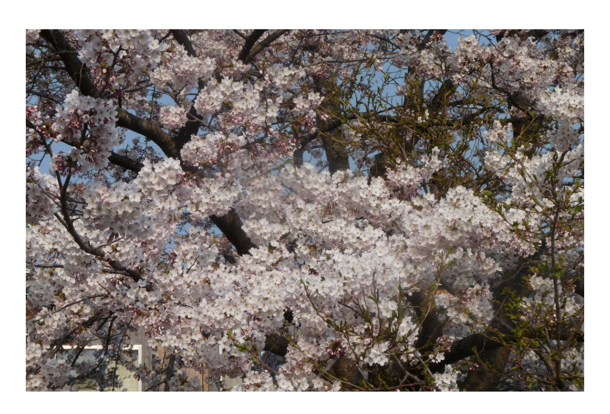
JAL Foundation Award Japanese section