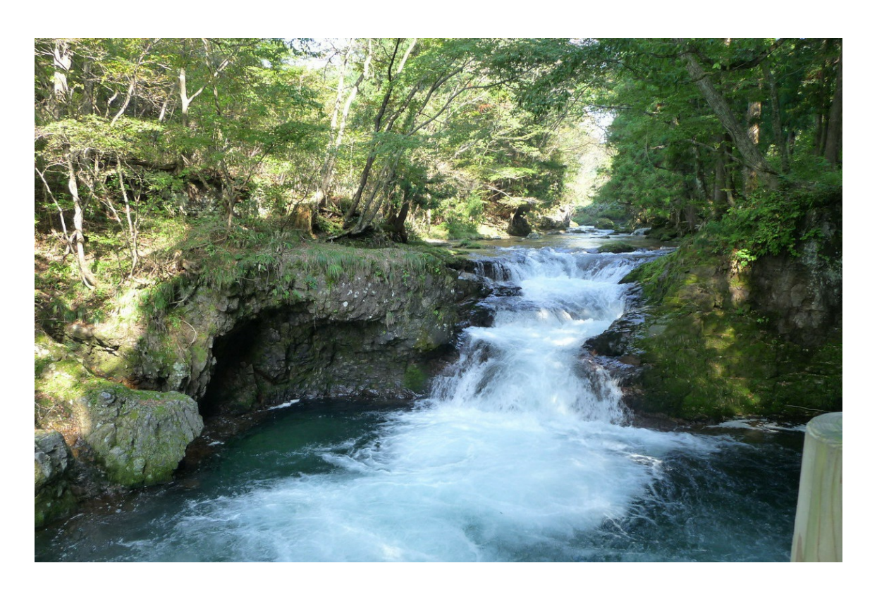
ウラジオストク日本センター賞 (Award by Japan center in Vladivostok)