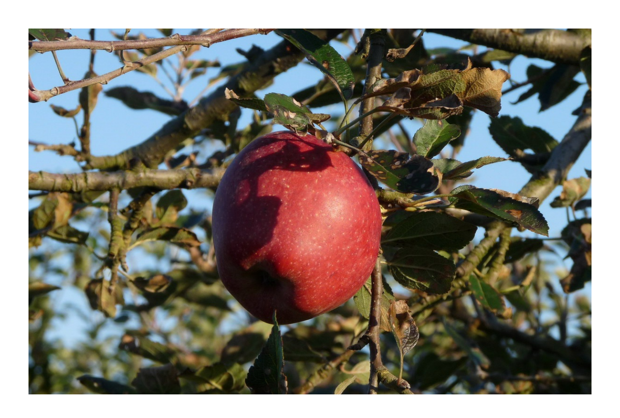
The 2<sup>nd</sup> Contest (2013)

国際俳句・川柳・短歌ネットワーク賞 (Akita International Haiku Network Award) Japanese section